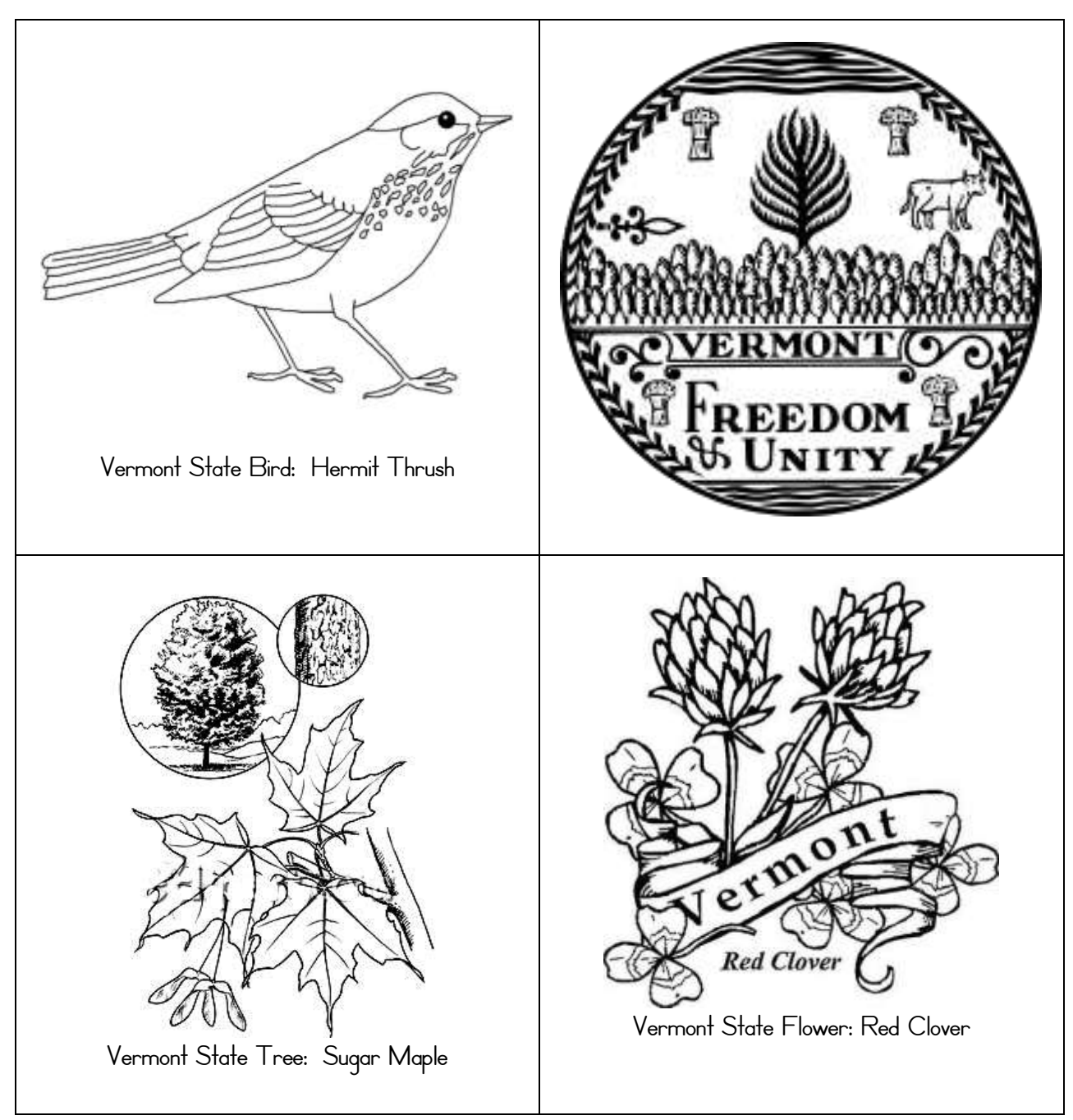
A to Z Kids Stuff http://www.aozkidsstuff.com