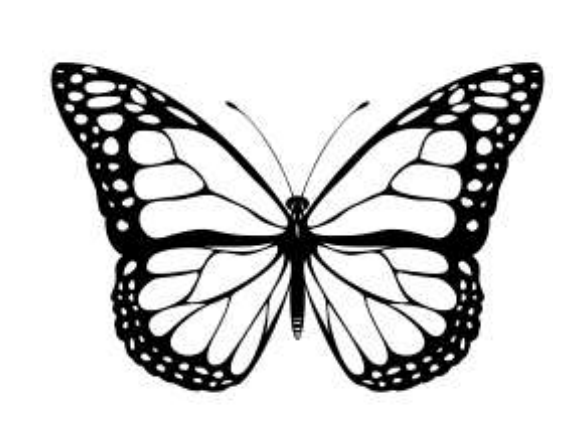
Vermont State Butterfly: Monarch